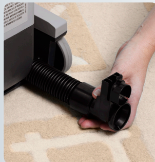
Easy access to suction hose for removal of any blockages that may arise